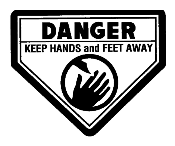
PART NO. 5154 – Danger Decal (x3)

PART NO. 5312 - Cover Removed Decal (x1)